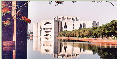
National Parliament of Bangladesh