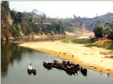
Bandarban hill tract

Reaching out to maternal and newborn health beyond MDG: promise to renew