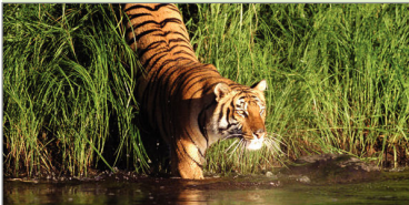
Sundarban mangrove forest